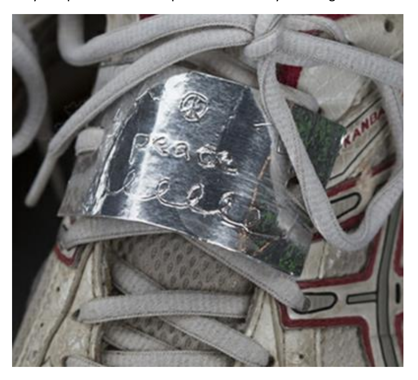
Talk About It

Practice Lacing Have kids unlace their shoes so the laces come out of the top two holes. Kids can then thread the laces through the tags and re-lace them. If you have kids who don't have on shoes with laces, they can practice on extra pairs of sneakers you brought.